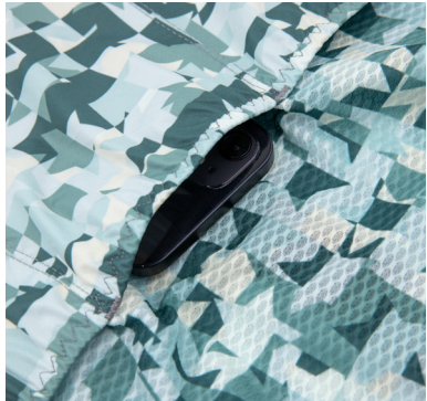
⊙ Three full-sized back pockets for storing your essentials