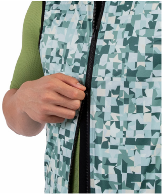
⊙ Double-slider front zip to allow ventilation even from below.