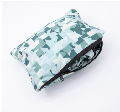
⊙ Easily packs away into normal-sized jersey pocket.