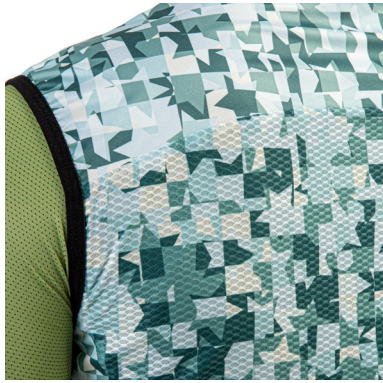
⊙ Mesh backing allows airflow and assists in body temperature regulation