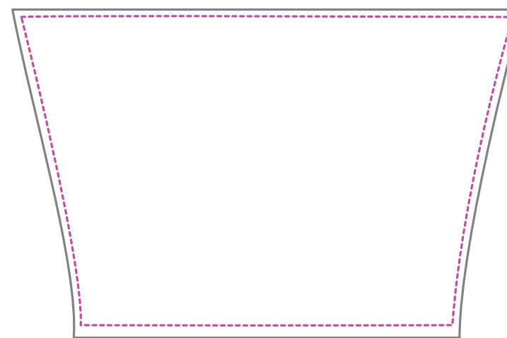
LEFTSOCK TOP PANEL